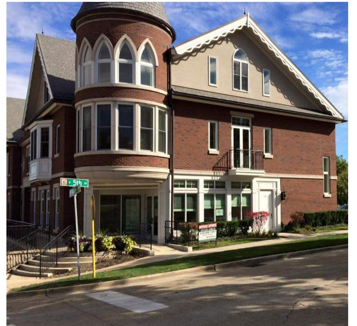
DeBryne Insurance Agency is located at the corner of 5th and Main Street in St. Charles, IL

DeBryne is an independent insurance agency; rather than working for a bigger insurance company, they focus on serving their clients. They pride themselves on their “old fashioned” approach to business, focusing on customer service and expertise in the industry. The company has two offices and employs four people across locations in Illinois and Wisconsin.